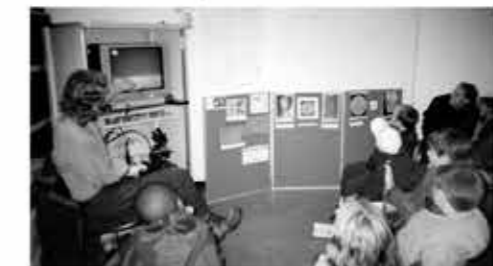
Right: The refurbished classroom is a brighter, warmer and more flexible environment for trainees' learning. It is also used for delivering video microscope workshops for schools. The equipment was launched in National Science Week.