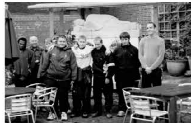
Above: A major commission for the Garden Furniture workshop came from the Janyang Buddhist Centre in Kennington. The new Courtyard Cafe has been developed by the Centre for the local community with funding from the Cross River Partnership. Roots and Shoots workshop made thirteen tables and a set of children's garden furniture for the courtyard. The trainees are seen here watched over by the Buddha.