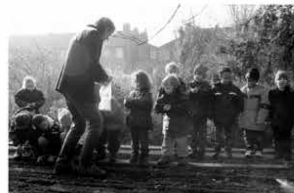
Left: The Lambeth Corn Field was planted in January 2001 by children from Walnut Tree Walk Nursery. The crop grew better than in 2000 and we were able to harvest the crop in August. Some of the crop was taken to the school for their Harvest Assembly, the remainder was kept for seed to be planted this winter.

At last Roots and Shoots is in a position to be positive about the future. Our 25 year lease is now signed and secure and funding for our current activities has been realised. Through the generosity of the Focus Legacy Fund, we are now able to move towards making our dream of a new Hall Building with modern facilities a reality. The architect has been appointed and draft plans drawn up. We can now work towards a 5 year Plan and Strategy for the long term sustainable future of Roots and Shoots. The future will also see a difference in the way we deliver training. The first year will be a Life Skills programme leading into NVQ Level 1 in the second year. This will enable our young people to develop their skills and realise their potential.