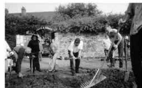
Right and Below: Roots and Shoots have been working closely with the local community through the Friends of Lambeth Walk Open Space to improve the area of public open space outside our new side gate. A Community Planting Day sowed a meadow and planted a border. Funding is from the Cross River Partnership.