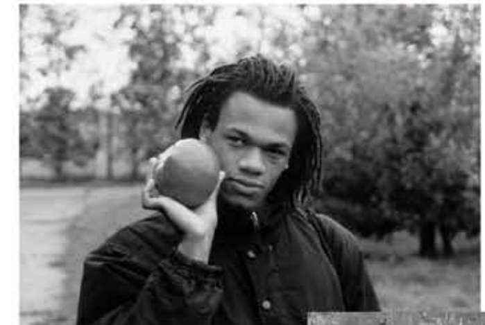
Above and right: For National Apple Day the trainees again visited Brogdale Orchards in Kent. The celebrations on the 21st October were thoroughly enjoyed despite the continuous downpour!

These pages use images to reflect this very successful year at Roots and Shoots. Work on the site has progressed well, with trainees' practical and classroom work complemented with a very wide range of work placements. Open Days and other events have all been very well supported by the community. School visits have also expanded dramatically during 2001.